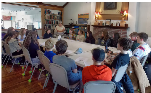
Students preparing for Poetry Night