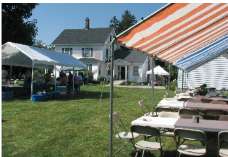
Annual Pig Roast