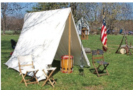
Civil War reenactor's camp Part of Civil War Saturday in 2013

The museum, in relating to its collection and mission, offers events and programs throughout the year. For more information, visit our website.