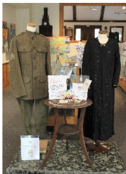
Parts of our World War I Exhibit