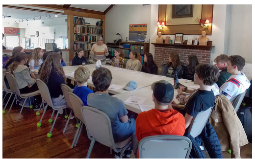
Students preparing for Poetry Night