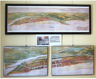
exhibit includes a 3' framed print of the entire banner on top, with two detailed enlargements of the left half of the banner below it (containing the most interesting areas, including Hampton harbor on the left through the Casino and then Church St. areas on the

Well, we finally finished it and the exhibit is now on display, with a complementary series of webpages. The museum