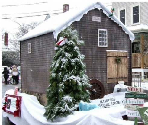
HHS Christmas parade float

Meet in the High Street parking lot at 1 pm. Reservations are requested by calling the Tuck Museum at 603-929-0781. A $10.00 per person fee insures future walks with a brochure of the walk included. This year, 2013, is the 375th anniversary of the town of Hampton. This walk is a great way to get to know your town.