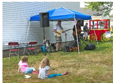
Scene from the 2017 Pig Roast