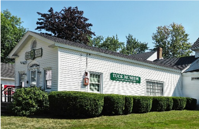
Our new sign! More on page 5