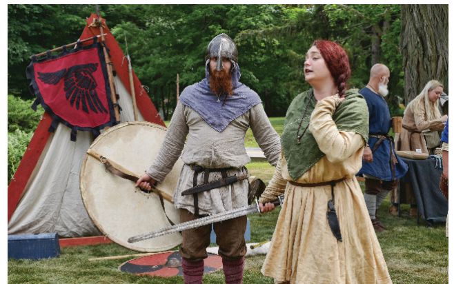
Viking battle techniques

The mission of the Hampton Historical Society is to increase public knowledge and understanding of the history and cultural heritage of the town of Hampton, New Hampshire, from its earliest inhabitants to the present generation. We will communicate that history through an active museum, educational programs, and a resource library.