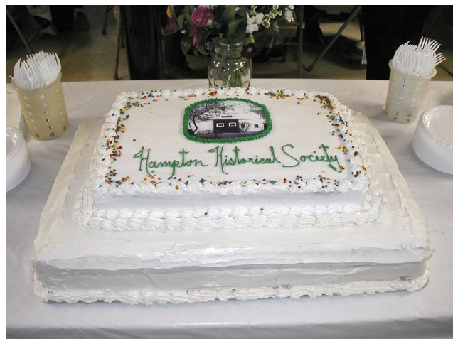
Cake from recent Barn Fund-raising Dinner