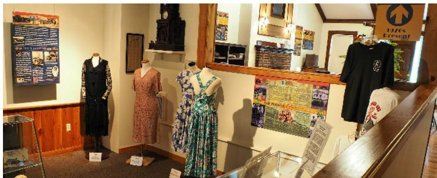
Part of Gathering on the Green exhibit